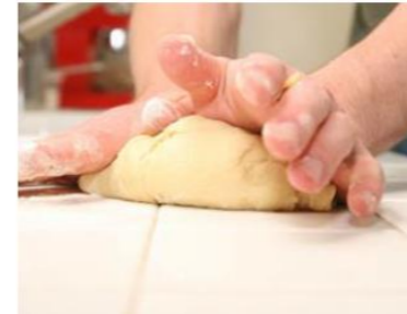
Kneading a bread dough