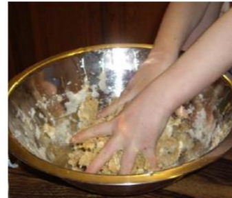
Rubbing in to mix fat and flour if making a yeast-based product