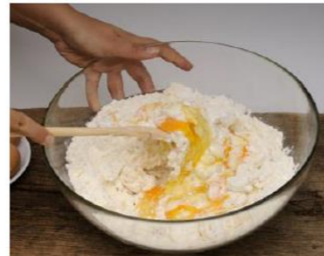
Mixing to combine ingredients if making savoury muffins or scones