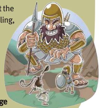
Bible story based on 1 Samuel 17

This was a day no-one would forget, when the courage of a shepherd boy saved a nation.