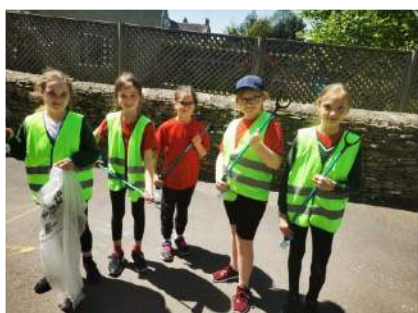
Keeping the school grounds tidy with our litter picking kit!