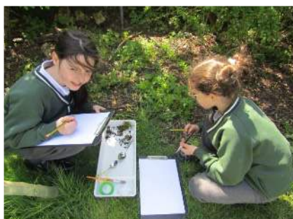
Thinking about how we can protect invertebrate habitats on Earth Day.

July is the time of year when we put together our submission to renew our Green Flag award. This is an Eco Schools accreditation to acknowledge the work done by our school in three or more areas of sustainability: School Grounds, Transport, Waste, Water, Biodiversity, Global citizenship, Energy, Healthy Living, Marine and Litter. This is a world-wide scheme and a prestigious award that we are proud to hold, currently with Merit, recognising that we have gone over and above the standard requirements needed to receive this award. Read more about Eco Schools here: https://www.eco-schools.org.uk/